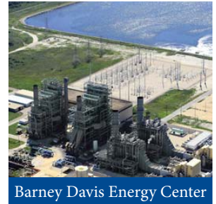
Barney Davis Energy Center