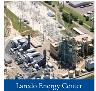
Laredo Energy Center

Topaz Power Group invested $1.2 billion in 2007 to construct or refurbish 3 sites and 1.8 GW of generation capacity in south Texas. The project was completed in 2010.